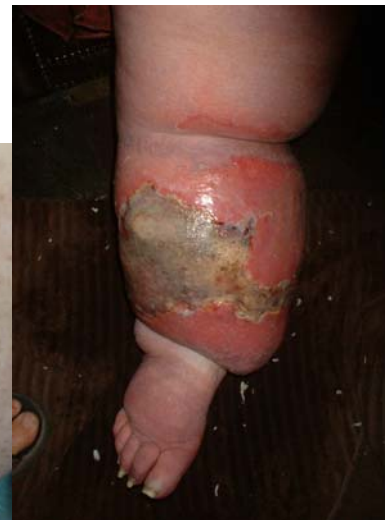
Regional infection (cellulitis)