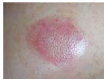
Figure 4. Day 9.