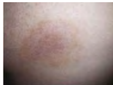
Figure 6. Three months post injury.