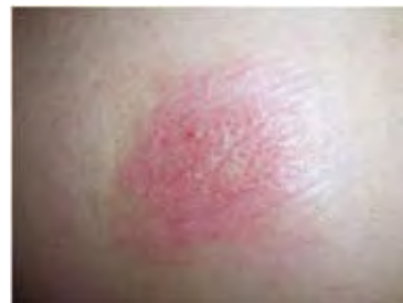
Figure 5. Day 12.