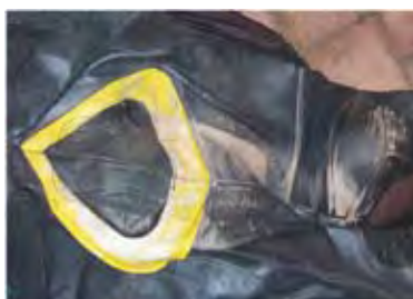
Figure 1. Friction on leather prior to friction on skin.