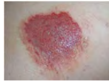
Figure 2. Three days post initial injury.