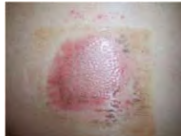
Figure 3. Day 6.